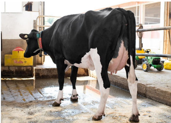
PROGENESIS CHARLEY TULIP FIFTH DAM