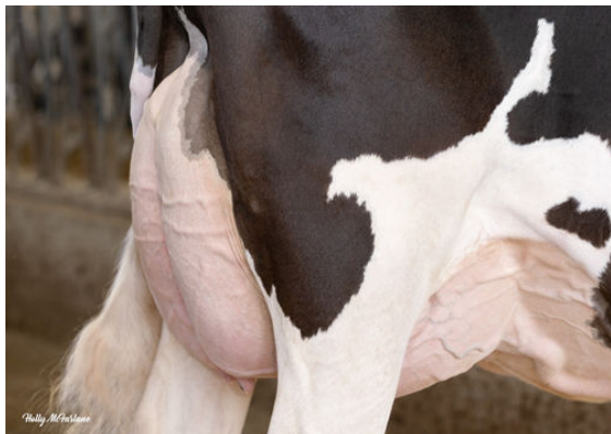
PROGENESIS GAMEDAY SIGNAL