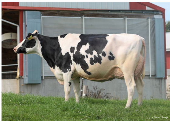
AOT DELUXE HI-LIGHTED