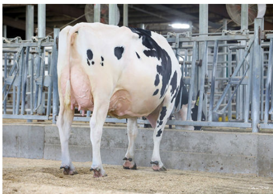
AOT DELUXE HI-LIGHTED