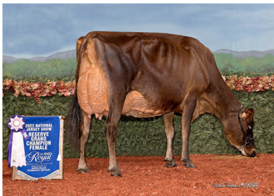
DULET VICTORIOUS BAGEL DAM