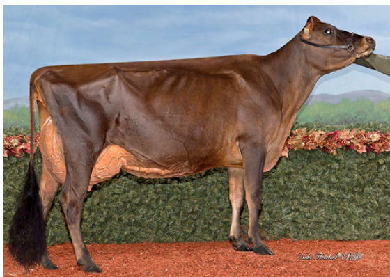
DULET VICTORIOUS BAGEL DAM