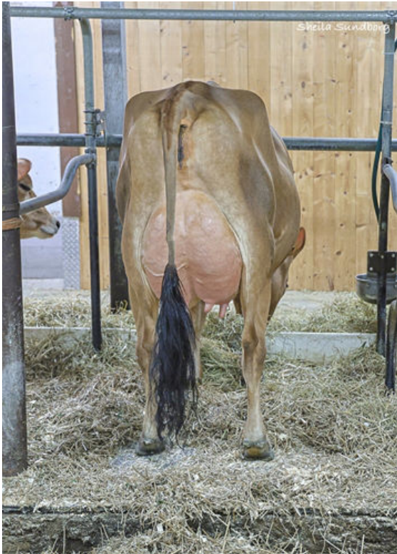
DULET BOOMERANG SALLY